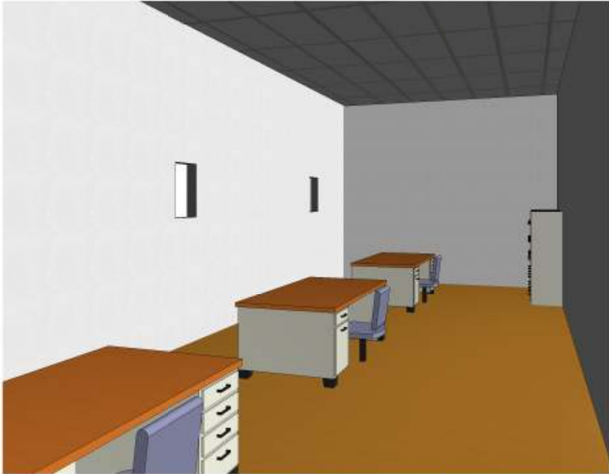
① main office