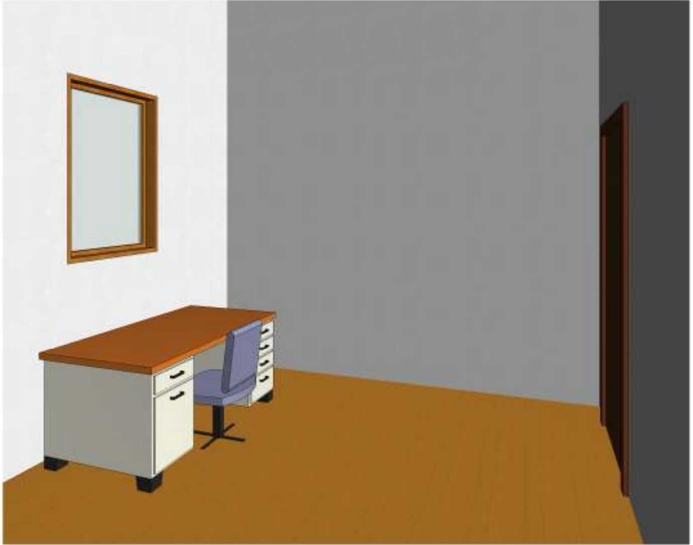
① office room